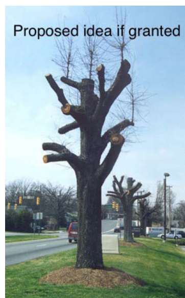
Photograph 1: Proposed pruning from refused application 2018/1002/TPO.